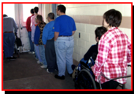
Adults are waiting for services